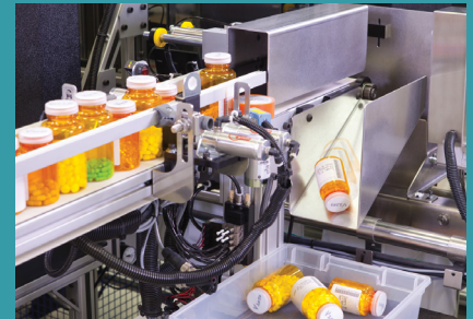
Incomplete or mismatched orders are diverted to a side rejection bin