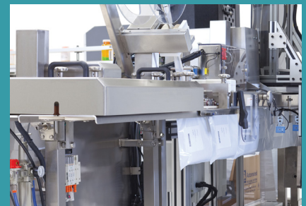
Shipping label is automatically printed and applied before the finished bag is sealed and moved to the shipping area