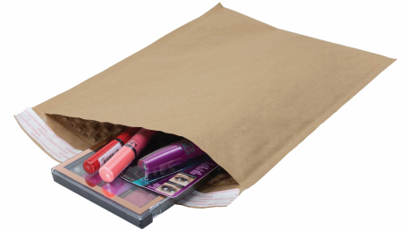
Shown: BUBBLE WRAP® brand paper bubble mailer with beauty products