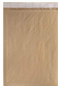
Shown: BUBBLE WRAP® brand Paper Bubble Mailer

Our paper bubble mailers converge the sustainability of recyclable paper with the protection of BUBBLE WRAP® brand cushioning. These paper mailers are the newest innovation in our discrete mailer portfolio, with inner padding constructed of a kraft paper material that mimics BUBBLE WRAP® brand cushioning. Protect products during shipment just like the Jiffyllite®, kraft bubble mailers, and delight consumers with curbside recyclable packaging materials.