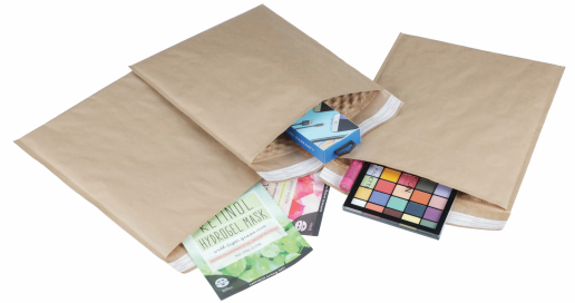
Shown: BUBBLE WRAP® brand paper bubble mailer with assortment of consumer goods