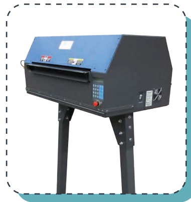
Instasheeter ™ Converting System